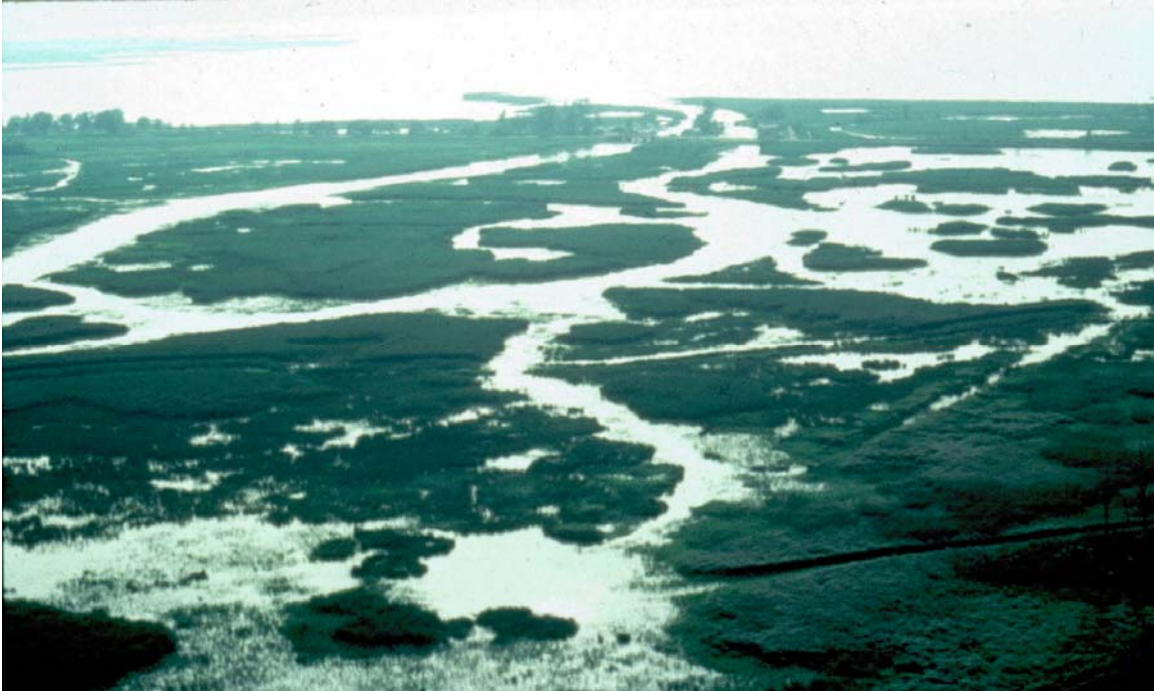
Big Creek Marsh - Long Point Wetland Complex